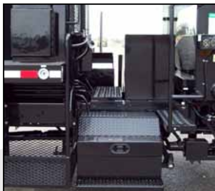
Catwalks for Accesibility