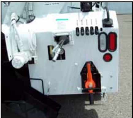
Hydraulic Tool Circuit