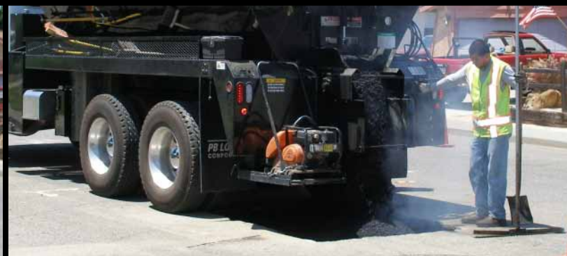
Add asphalt mix.