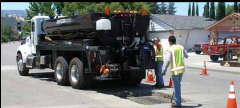
Remove old material, create a firm base and tack the hole edges.

PB Makes Pothole Patching Easy...With One Machine