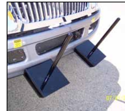
Safety Cone Holders