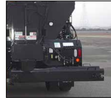
Side Dumping Conveyor