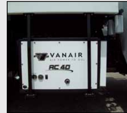
Hydraulic Vanair Compressor