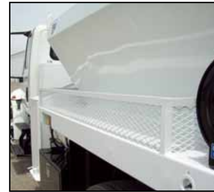
Open Tool Basket