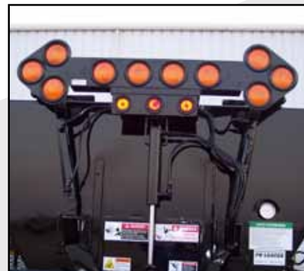
Arrow Board with Bracket