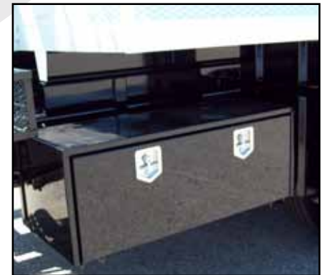
Underdeck Tool Box