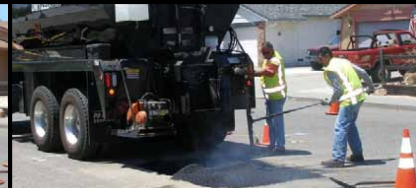
Seal and make a permanent patch!