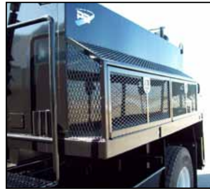
Lockable Tool Basket