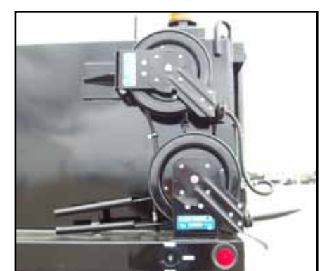
Retractable Hose Reels