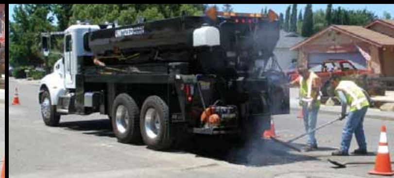
Compact asphalt material.