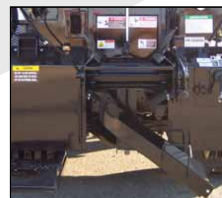
Pivoting Asphalt Chute