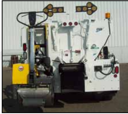
Roller Transport Device