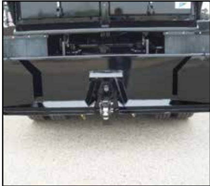
Options available for all hitch types and heights.