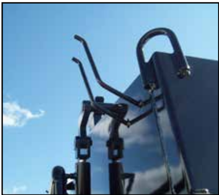
Rake, shovel and broom holders in several styles for convenient use and storage.