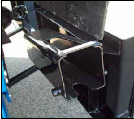
Pneumatic breakers and custom lockable holders built to fit your hammer.