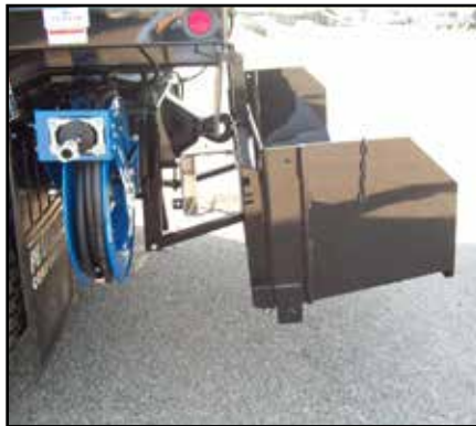
Folding Asphalt Patch Apron is removable for your convenience.