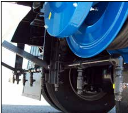
Spray bars allow your pothole patcher to double as a liquid asphalt distributor when necessary.