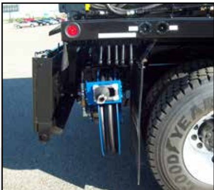
Rear ergonomic controls and pneumatic lines located curb side to keep workers away from traffic hazards.