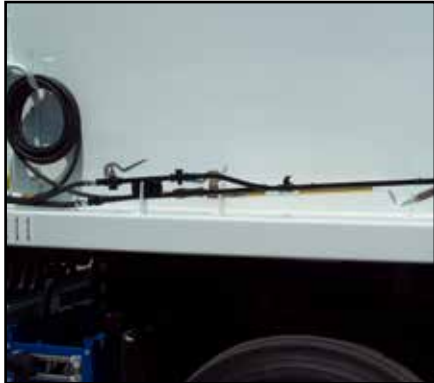
Emulsion wand stores securely in combination with waste tank to separate waste from usable material.