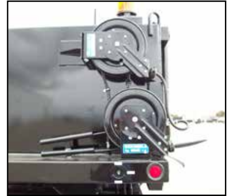
Hose reels of all sizes with the ability to mount in any location.