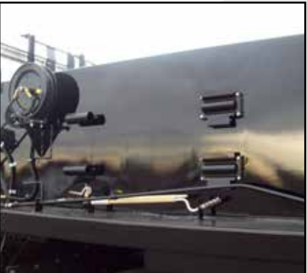
200,000 BTU hand torch eliminates moisture from potholes prior to sealing and patching.