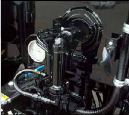
Electric and propane heater systems are available to keep emulsion systems hot around the clock.