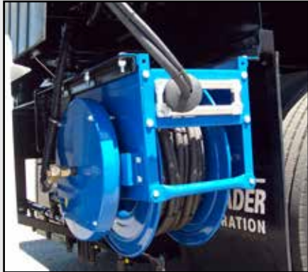
Dual hose reels optional for convenient air and emulsion spraying from the same wand.