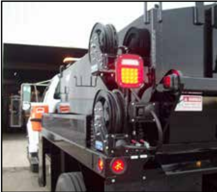
Air and solvent wands aid in clearing debris from potholes prior to sealing and patching.