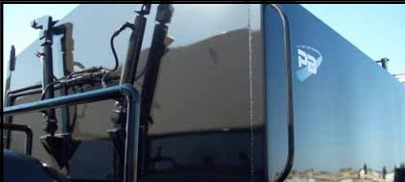
Heavy duty insulated asphalt boxes for durability and heat retention.