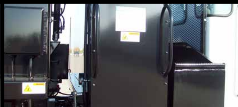
Heated, pressurized and pump-style emulsion systems make your patching program effective year-round.