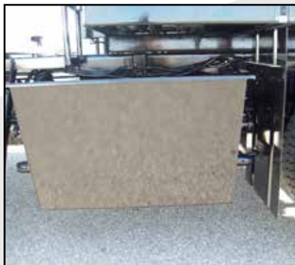
Hydraulic Dumping Spoils Bin