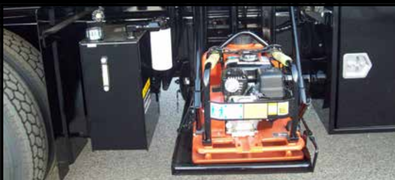
Several compaction options for pothole longevity.