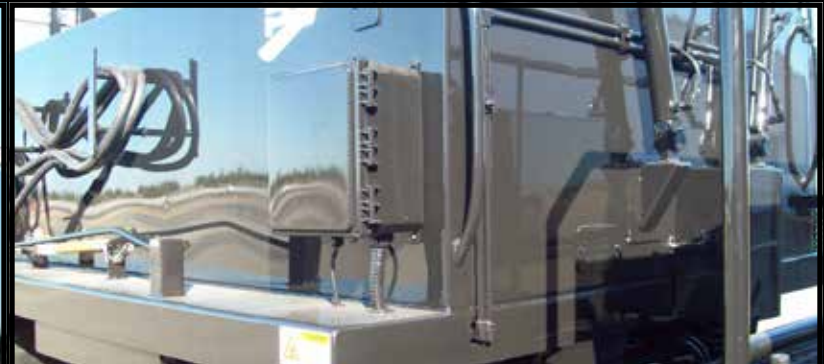
Integrated asphalt heating and emulsion systems to ensure waterproof pothole patching.