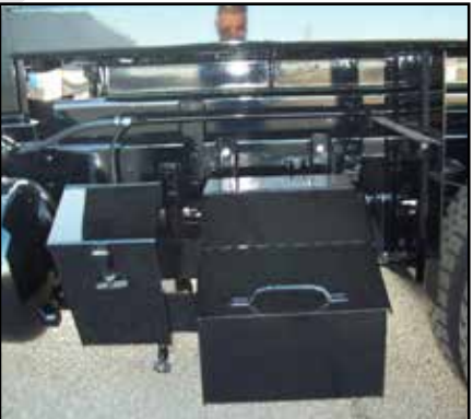
Sand box carries base material for deeper potholes and a solvent dip tank to clean tools before and after patching.