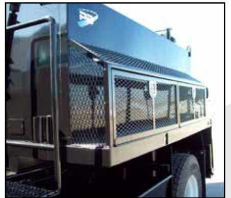
Secured storage in any size and shape for tools of any kind.