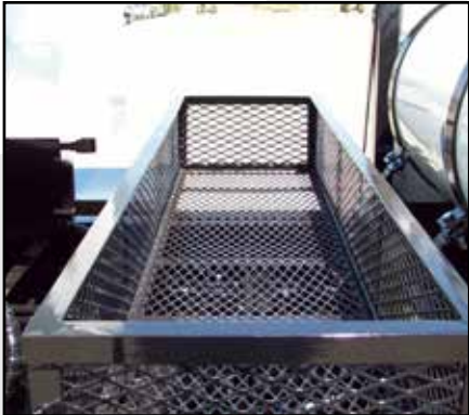
Easily accessible tool baskets for large or bulky items.