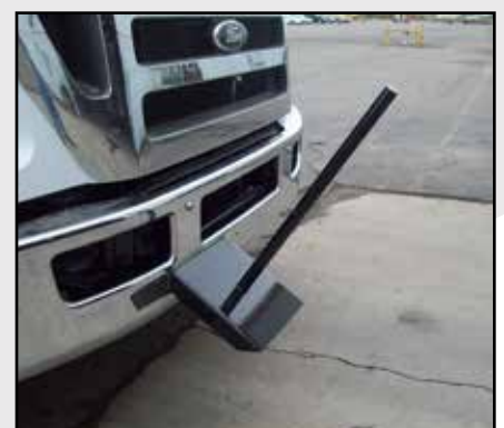
Bumper mounted Cone Holders save space and increase visibility.